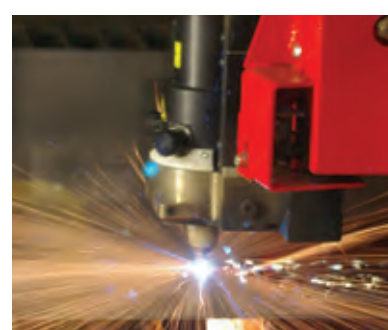
Bystronic Laser able to cut up to

In addition to the facilities directly owned and operated by the company, IAC works in close partnership with several other manufacturing organisations, notably in Eastern Europe, Middle East and India. IAC also has a large network of technical sales engineers, agents and distributors, offering advice and assistance to customers around the world. Several of these manufacture IAC products under license.