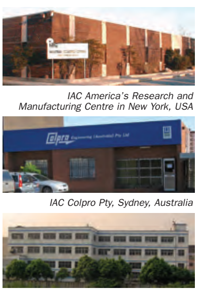
IAC China, Shenzhen, Peoples Republic of China