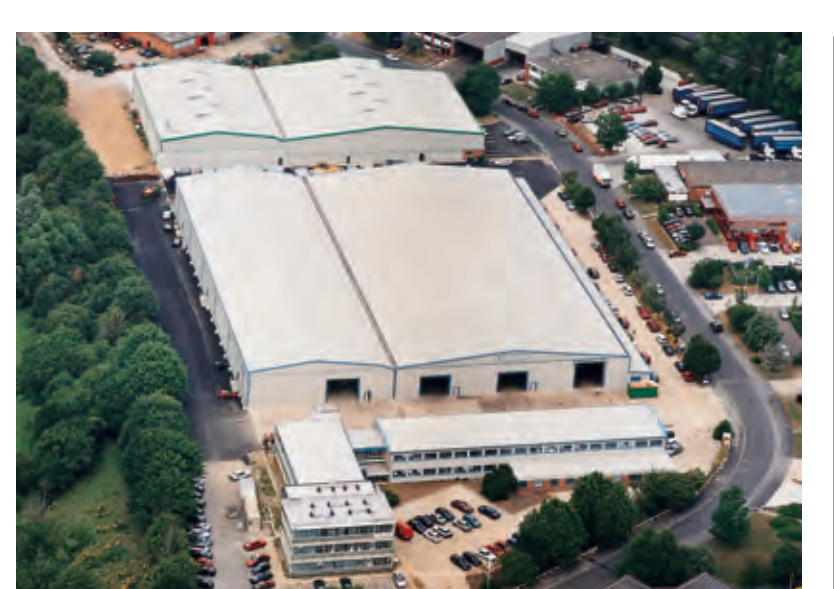
IAC's Global Headquarters at Winchester in the UK